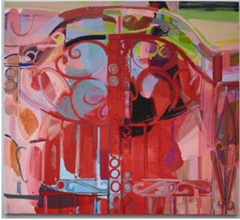
15. Bloom 2015 Oil and Cel-Vinyl on canvas 60 x 66 inches SAW252