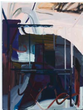
4. Blue Hour 2015 Oil and Cel-Vinyl on canvas 72 x 54 inches SAW279