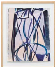
14. Consideration (4) 2015 Cel-Vinyl on paper 18 x 15 inches SAW284