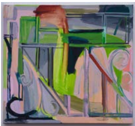
16. Blöndu 2015 Oil on canvas 22 x 24 inches SAW268