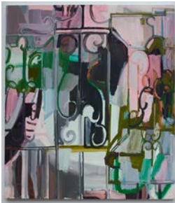
6. Garden Terminal 2015 Oil and Cel-Vinyl on canvas 48 x 42 inches SAW258