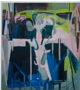
8. Blackheath 2015 Oil and Cel-Vinyl on canvas 54 x 48 inches SAW255