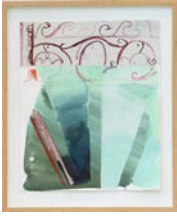
9. Consideration (1) 2015 Oil, Cel-Vinyl, ink and pastel on paper 18 x 15 inches SAW287