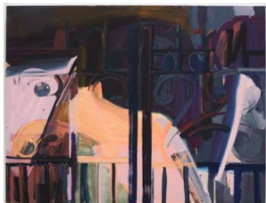
18. Studio @ 9 2015 Oil and Cel-Vinyl on canvas 38 x 50 inches SAW280