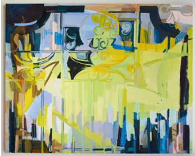
17. Unter den Linden 2015 Oil and Cel-Vinyl on canvas 72 x 90 inches SAW247