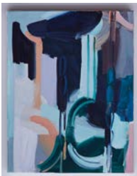
3. Stile's End 2015 Oil on canvas 18 x 14 inches SAW271