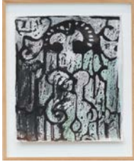
10. Consideration (5) 2015 Oil and ink on paper 18 x 15 inches SAW285