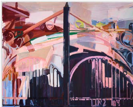
7. Desert Comfort 2015 Oil and Cel-Vinyl on canvas 72 x 90 inches SAW249