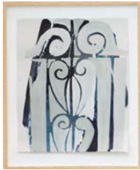
11. Consideration (6) 2015 Cel-Vinyl, gouache and pastel on paper 18 x 15 inches SAW282