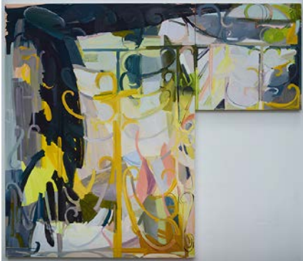
1. Pied-à-terre 2015 Oil and Cel-Vinyl on canvas 72 x 84 inches SAW253