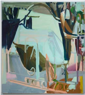
2. Prune and Graft 2015 Oil and Cel-Vinyl on canvas 66 x 60 inches SAW251