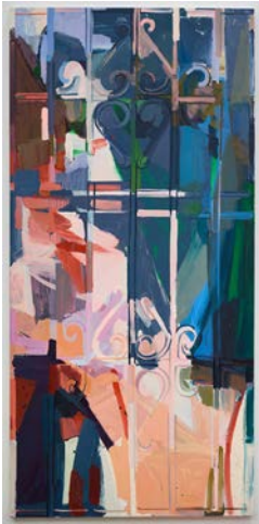
5. Studio Door 2015 Oil and Cel-Vinyl on canvas 84 ½ x 40 ½ inches SAW250