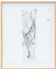
12. Consideration (2) 2015 Ink on paper 18 x 15 inches SAW288